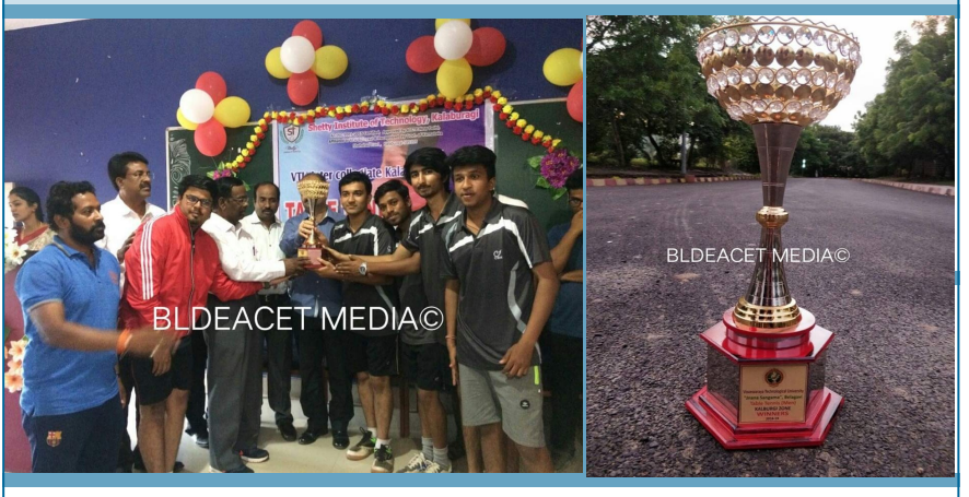
BLDEACET students won Table Tennis Tournament

The students of BLDEACET have won the inter Zonal (Kalaburgi Zone) Table Tennis tournament held at Kalaburgi on 2nd and 3rd September 2018.