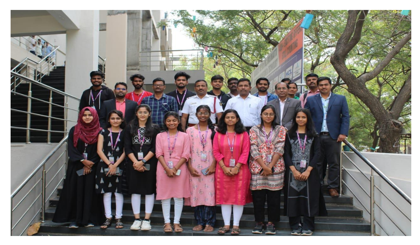
Team avengers with the guests and resource persons.

Adarsh Nagar, Ashram Road, Vijayapur 586103, Karnataka, INDIA